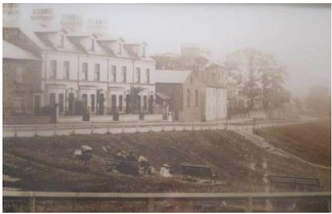
Figure 1: An early nineteenth century photograph of The Green

A photograph taken in the late nineteenth century appears to show the gabled frontage of the building was then brickwork, with a side porch; since then the walls have been rendered and the porch area to the north east has been remodelled.